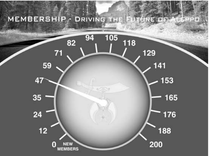
47 NEW MEMBERS IN 2013 SO FAR ON THE MEMBERSHIP DASHBOARD